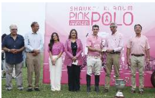
Iqra Aziz, TV actor and Shaukat Khanum Breast Cancer Awareness Campaign ambassador, attending the "Pink Polo" event, organised by SKMCH&RC, Lahore, in collaboration with Jinnah Polo & Country Club, to raise awareness about breast cancer.