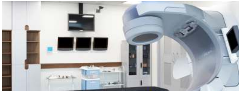
State-of-the-art equipment for diagnosis and treatment of cancer

The physical structure of Pakistan's largest tertiary care cancer centre was completed in late-November, 2022. Finishing work has commenced and the installation of equipment will be carried out throughout the coming year. The hospital will be equipped with the latest in technology for both diagnosis and treatment, and will be staffed by highly-qualified professionals. It is expected that the hospital will open at the end of December, 2023, Inshallah, when it will continue the tradition of our hospitals in Lahore and in Peshawar by providing state-of-the-art cancer treatment free of charge to the underprivileged.