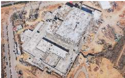
Constructed Area: 1 million sq. feet